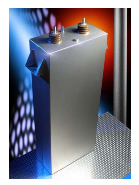
Figure 2: Trafim

and are specified at 3mF, 1890Vdc (DKTFM546); 2.5 mF, 2630 Vdc (DKTFM603); 1.67 mF, 4000 Vdc (DKTFM537); and 1mF, 4000Vdc (DKTFM538).